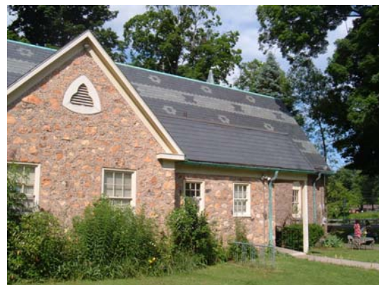
The Library's new roof.

The Friends thank the Rosendale Library Community for the great support shown for this enormous project. The beautiful new slate roof will protect the building for the next 150 years.